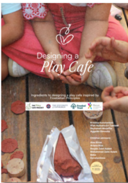
Designing a Play Cafe