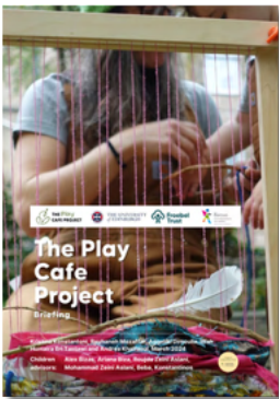
The Play Cafe Project: 1 st Briefing

We would love to hear from you, join us on instagram and on our mailing list.