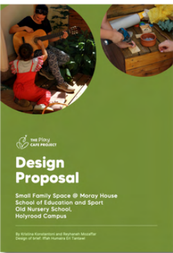
Design Proposal: Small Family Space at MHSES

Stay updated on our work, conferences and seminars through our website,